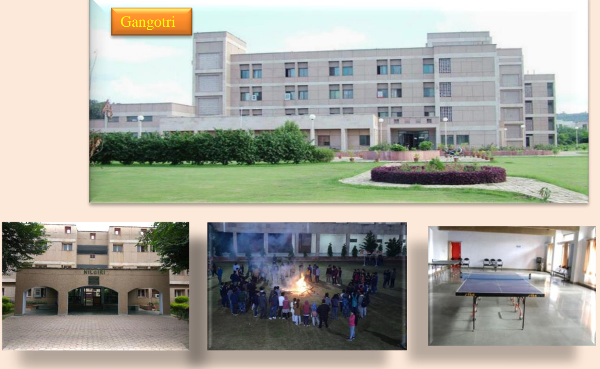
Page 5 of 17

Gangotri ( GH ):One of the oldest hostels in ABV-IIITM Gwalior, the first girl's hostel is characterized by wonderful architecture, airy rooms and impeccable maintenance. Gangotri is a perfect reflection of its ideology of discipline and perseverance, which is included in its residents every year. Well-known for the all-rounder performance of its inmates from sports, academics and extra-curricular at the institute level. Common rooms, reading rooms, spacious lawns and a mess serving nutritious meal at all times are some of its supreme facilities.