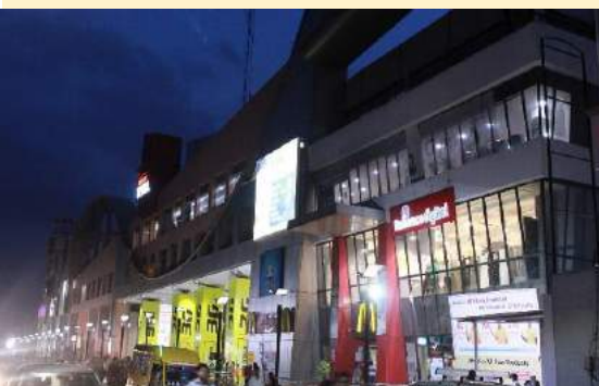
DD City Mall

Life in Gwalior city is vibrant accommodating its rich old culture fused with modern cosmopolitan facilities. Gwalior has emerged as an important tourist attraction in central India while many administrative offices are situated in the city and is surrounded by industrial and commercial zones. Hindi in its standard form is widely spoken in Gwalior followed by Marathi as the second biggest language. Gwalior has a sub-tropical climate with hot summers from late March to early July, the humid monsoon season from late June to early October, and a cool dry winter from early November to late February. Travelling in the city is quite safe and several public and private transportation services are available. There are a few good fine dining and casual dining restaurants available which offer a variety of cuisines at affordable cost. Besides these several popular food outlets such as Pizza Hut, Dominos, McDonald, Subway etc. are available in the Deen Dayal (DD) City mall & DB mall, situated at about 8 kms and 7 kms respectively from IIITM campus. These mall houses a number of showrooms, Big Bazar, Gamezone, Multiplex etc. and operates on all days from 10 am to 10 pm. Gwalior Fort is a hill fort in Gwalior and it is 4kms away from IIITM campus. The fort has existed at least since the 10th century, and the inscriptions and monuments found within what is now the fort campus indicate that it may have existed as early as the beginning of the 6th century.