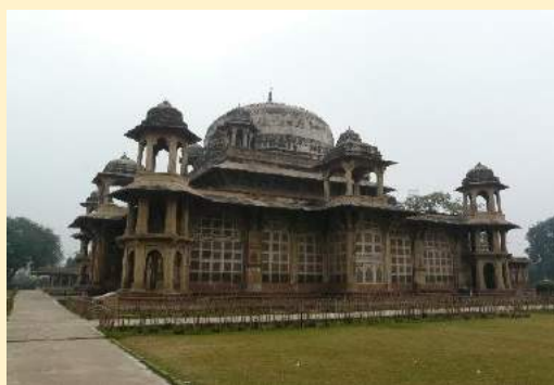
Tomb of Tansen