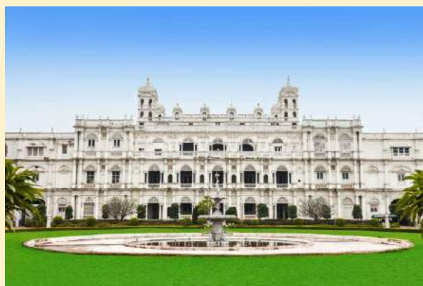
Jai Vilas Palace Museum